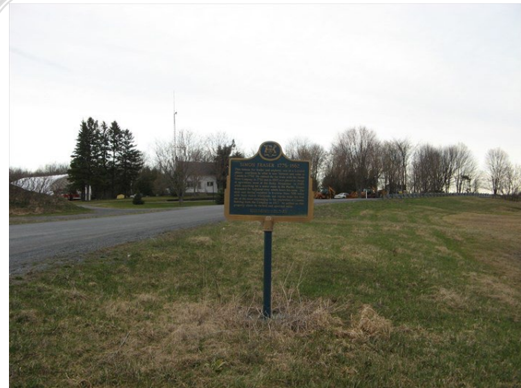
Site of Simon Fraser's Mills